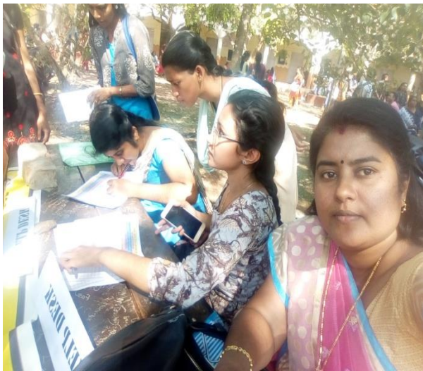
Volunteers giving help to choose the suitable companies