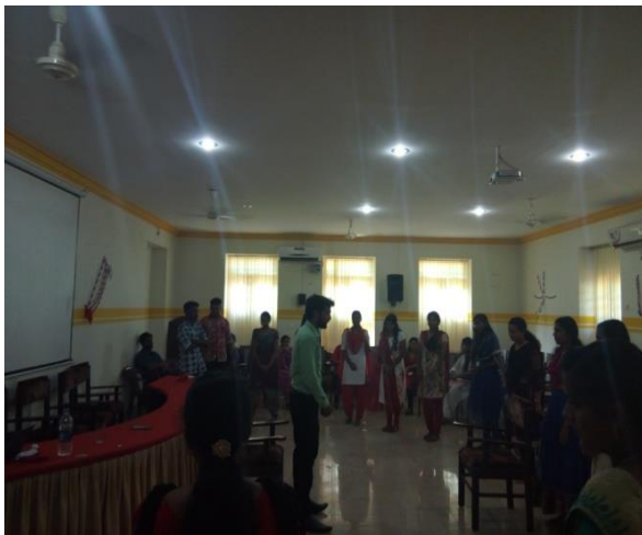
Session on interview skills