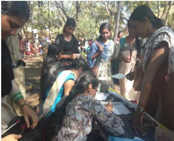
Participants registering at help desk