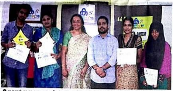
മാതൃഭൂമി അക്ഷരാസവത്തിന്റെയും മറ്റും കോളേജുകളിലെ വിദ്യാർത്ഥികൾക്ക് സാഹിത്യ പ്രവേശനം നൽകുന്ന ലിറ്റററി ക്ലിപ്തർ പ്രദാനം ചെയ്യുന്ന ചടങ്ങിൽ പങ്കെടുത്തുകൊണ്ടിരിക്കുന്ന എസ്.എൻ.എസ്. കോളേജിലെ വിദ്യാർത്ഥികൾ.