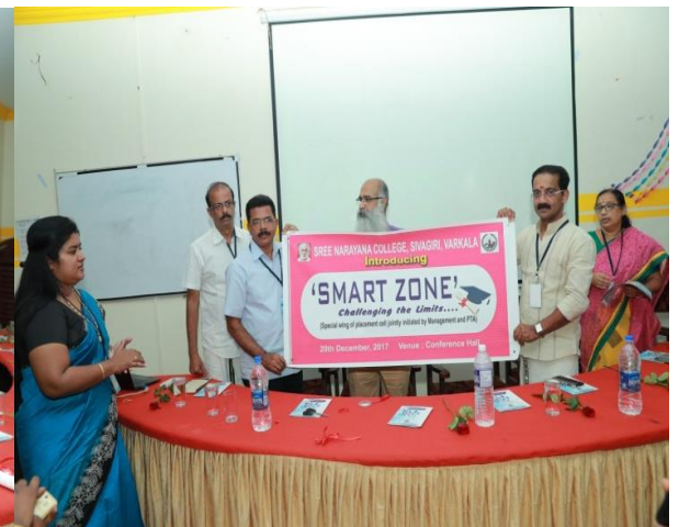
Inaugurating SMART ZONE Programme