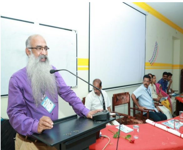
Inaugural address by Sri. Ajith Ramaswamy