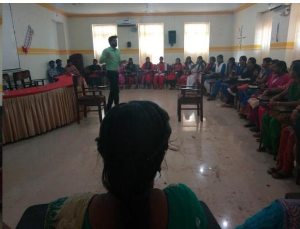
Session on interview skills