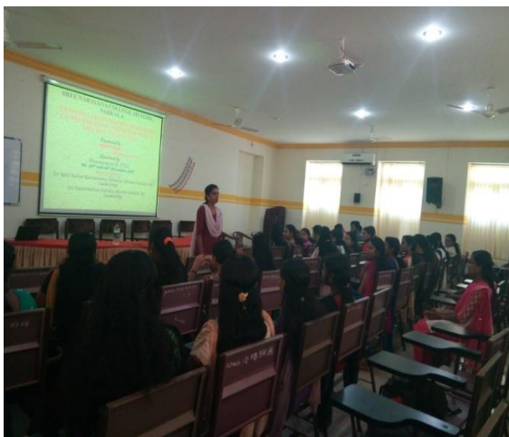
Self introduction by participants