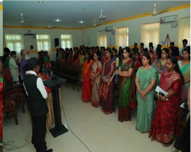
Prayer by college prayer team