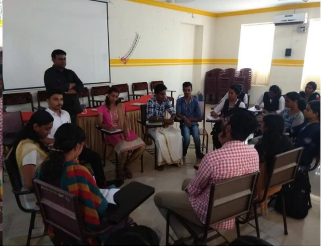
Group discussion session