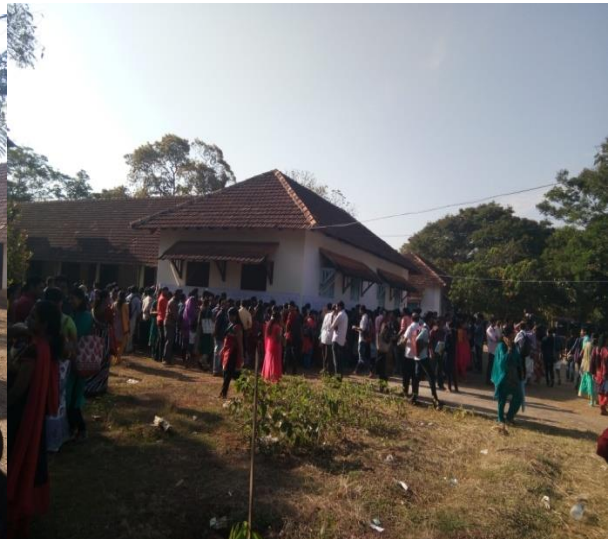
job seekers participation .....