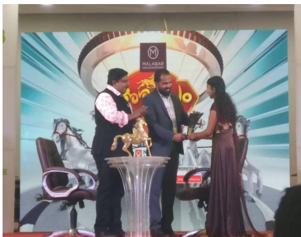
Receiving a token of participation