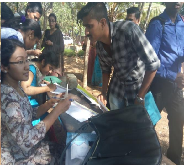
Volunteers giving instructions