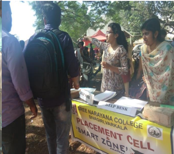
Volunteers of placement cell in action