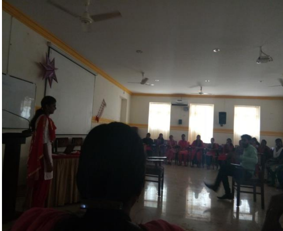
Session on interview skills