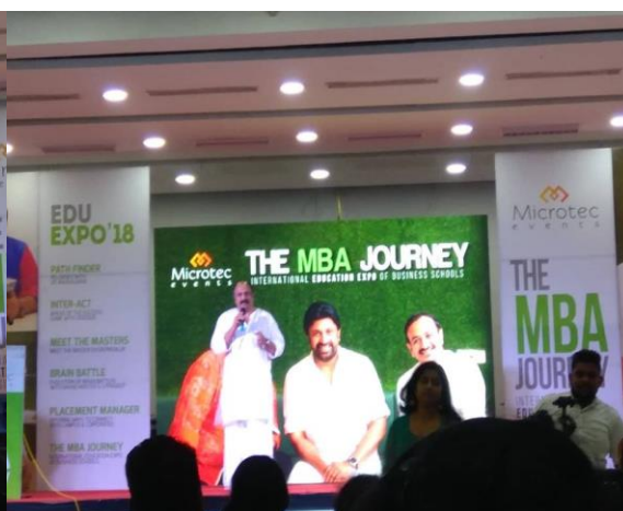
Interaction with actor Sidhique