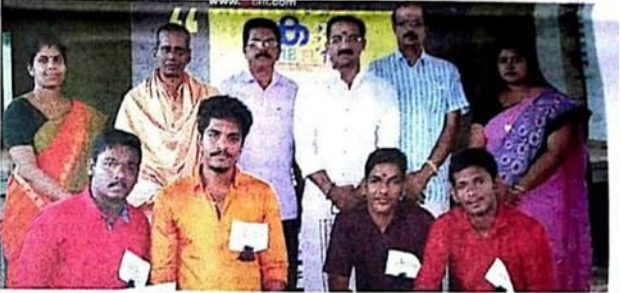
മാതൃഭൂമി ലിറ്റററി ക്ലിപ്തർ വിതരണ ചടങ്ങിൽ പങ്കെടുത്തുകൊണ്ടിരിക്കുന്ന എസ്.എൻ.എസ്. കോളേജിലെ വിദ്യാർത്ഥികൾ.

മെമ്പർമാർ എസ്.എൻ. കോളേജിലും വർക്കല എസ്.എൻ.കോളേജിലും സാഹിത്യ പ്രവേശനത്തിൽ വർക്കല/മെമ്പർമാർ - ഒരു മാർച്ച് മാസത്തിൽ കോളേജുകളിൽ നടത്തിയ സെമിനാറുകളിലും പങ്കെടുത്തുകൊണ്ടിരിക്കുന്ന എസ്.എൻ.എസ്. കോളേജിലും വർക്കല/മെമ്പർമാർ സാഹിത്യ പ്രവേശനത്തിൽ പങ്കെടുത്തുകൊണ്ടിരിക്കുന്നു.