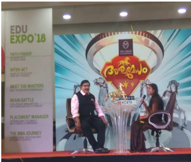
Our student participating in aswamedham