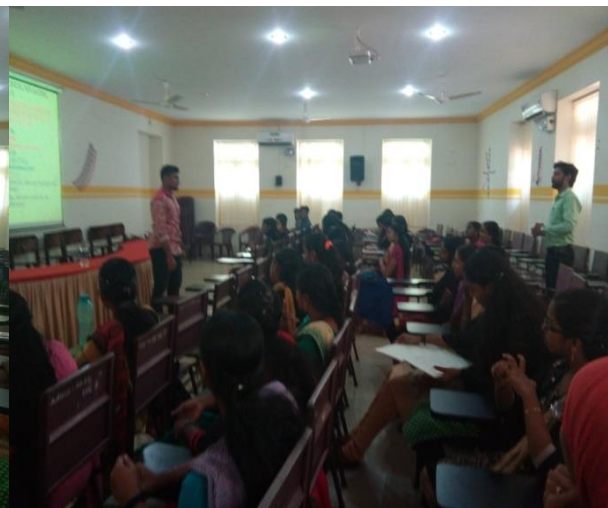
Self introduction by participants