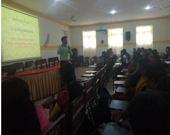
Session on C V Preparation