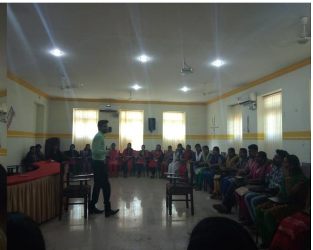
Session on interview skills