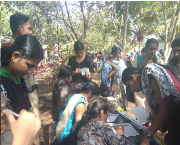
volunteers helping to fill the form