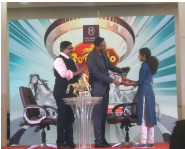
Receiving a token of participation