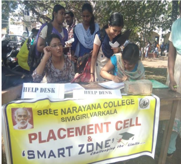
Help desk of S N College, sivagiri