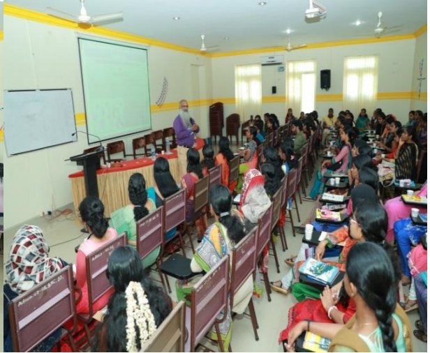
Technical session continues.....