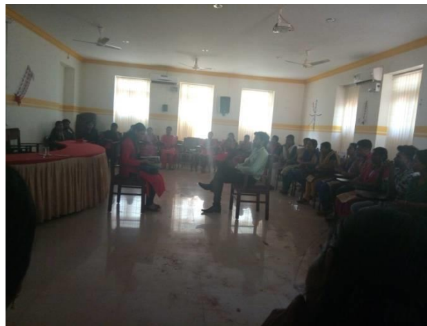
Session on interview skills