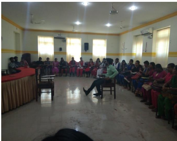
Session on interview skills