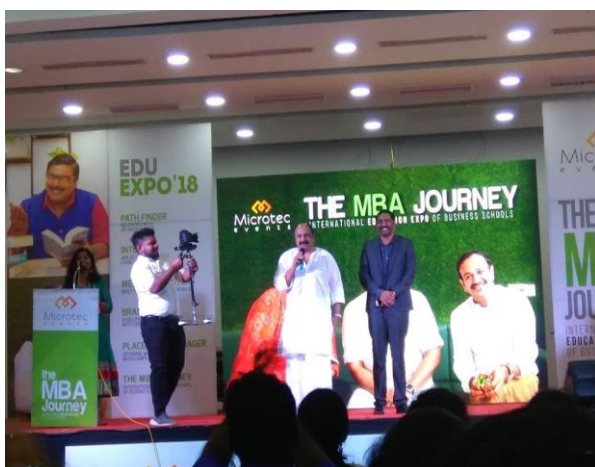
Interaction with actor Sidhique