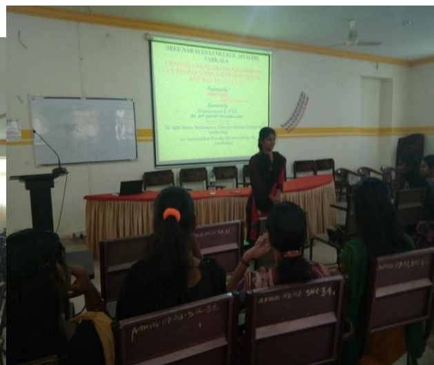
Self introduction by participants