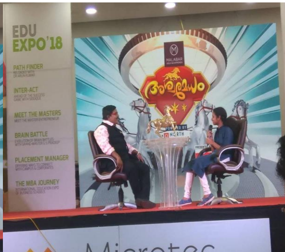
Our student participating in aswamedham