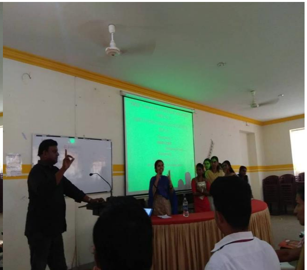
Practical sessions on interview facing techniques.....