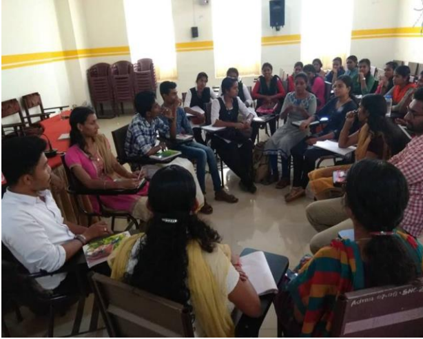
Group discussion session