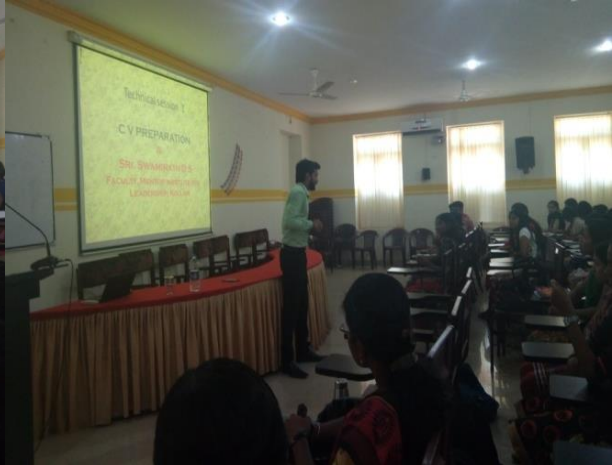
Session on C V Preparation